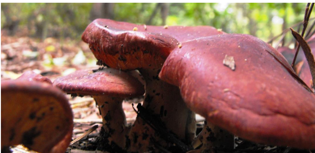
Photo – Fungi garden in the Rainforest